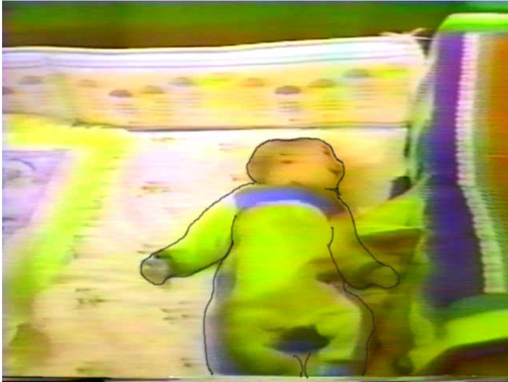
Figure 1. An 8-month old Asperger's infant is lying with its head facing its own left. In a normal infant, this would signal turning over to its left, if such a turn were to occur.