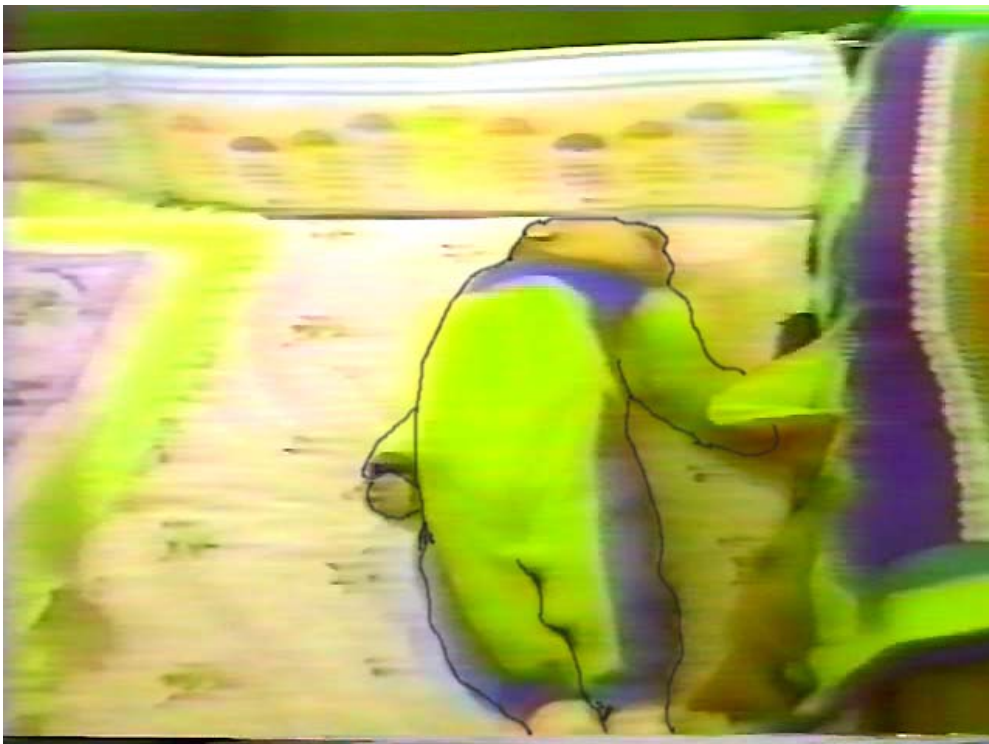
Figure 2. The Asperger's infant arches its back, in preparation for turning over.