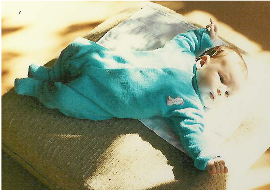
Figure 5. A normal baby showing the asymmetrical tonic neck reflex.