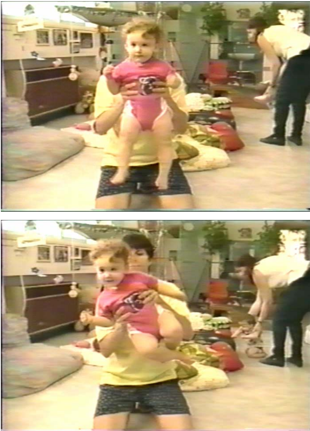
Figure 6. (Top) The “tilting test” in a normal 6-months-old child. The head and body are held in the vertical position. (Bottom) The child’s body is slowly tilted about 45 degrees to the child’s right. The child maintains its head in the absolute vertical, rather than remaining in line with the midline axis of the body. The slow tilt is then repeated toward the other side, and the normal baby will again maintain its head in the vertical. In a subgroup of autistic children, the head remains in line with the midline axis of the tilted body, rather than orienting itself to the absolute vertical, on one or both sides of body tilt.